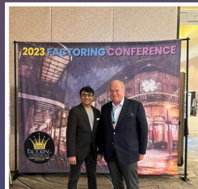
International Factoring Association Annual Conference, New Orleans