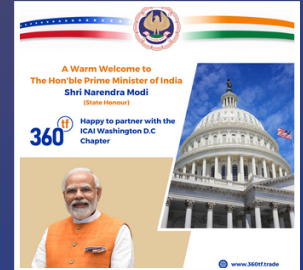
Supported ICAI Washington D.C. Chapter's White House Visit