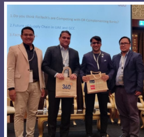
Association of Chartered Certified Accountants Annual Conference, Dubai