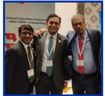
BAFT MENA Conference