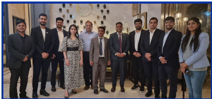
Ramadan Iftar Party