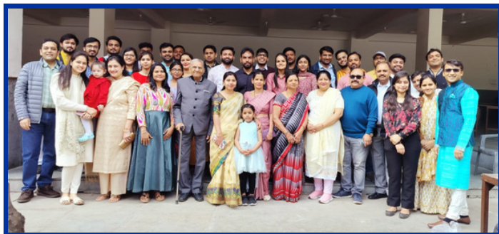
360tf Annual Family Meetup