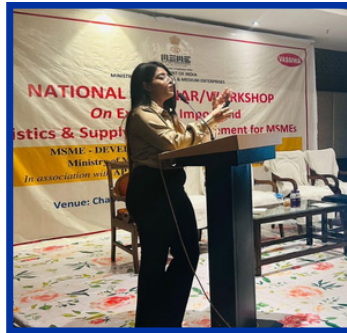
Engaging with Corporates