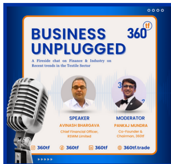
New Series Launched