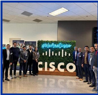
360tf team in delegation